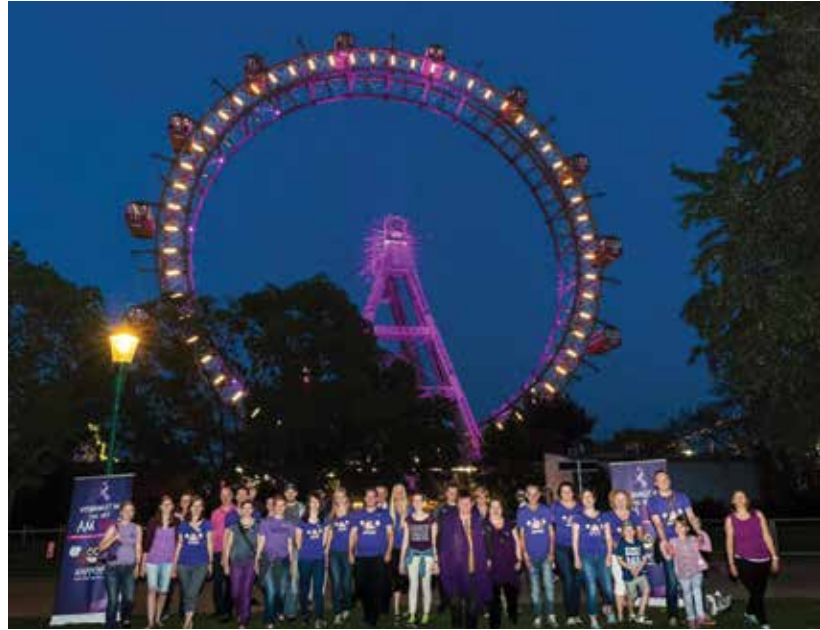
From top clockwise: The Mole (Turin, Italy), The Giant Ferris Wheel, Vienna, Austria, Umbrellas, Thessaloniki, Greece, colleagues in Bangladesh and Zagreb, Croatia