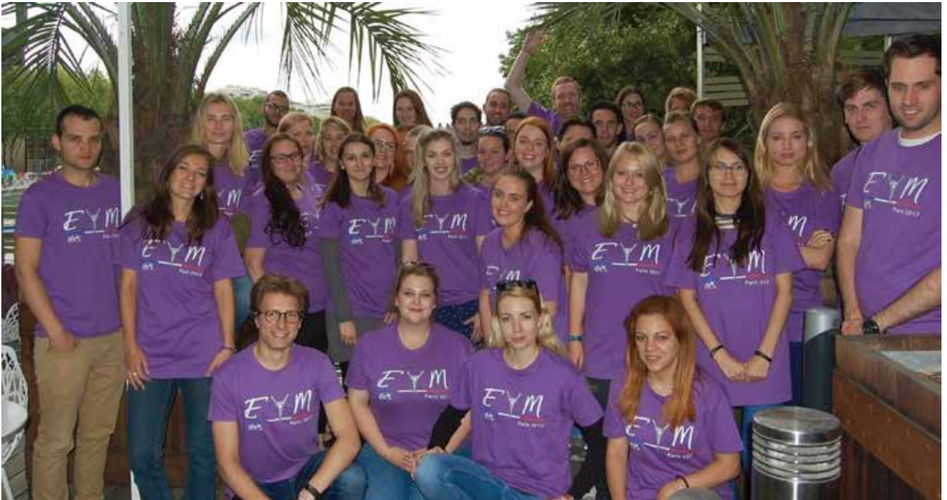
EFCCA Youth Meeting delegates, 27-30 July 2017, Paris, France

This year the European Youth Meeting for EFCCA (EYM) took place in the country of cheeses, fashion, love and the Eiffel tower. Yes, this year we were in France and more precisely we were in Paris