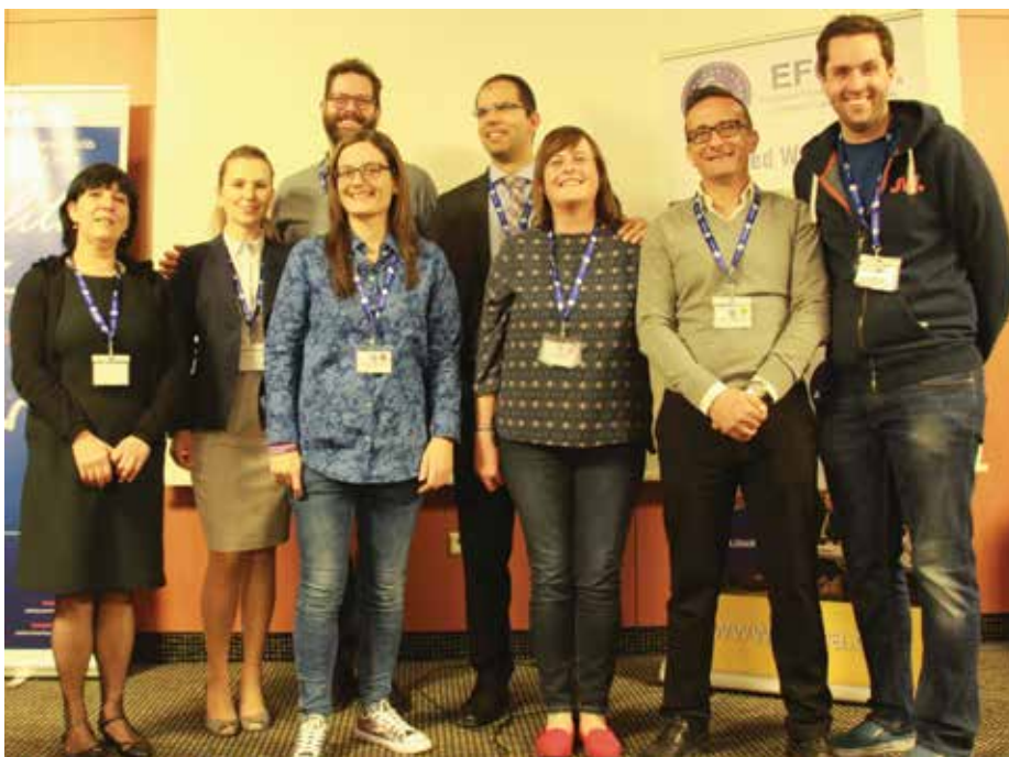
The new EFCCA Board (from left to right):

All presentations and other relevant documents that were presented at the EFCCA Annual General Meeting in Poland can be found in the Members Only section of our website.